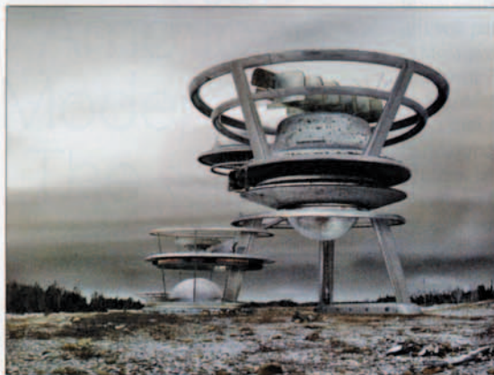
David Trautrimas, Storm Crown Mechanism , 2009, archival digital ink-jet print, 30" x 40". DNJ.

clearly an element of kitsch nostalgia to them. For the eleven ink-jet prints in this exhibition, "The Spyfrost Project," Trautrimas placed these imaginary Cold War edifices in desolate locations.